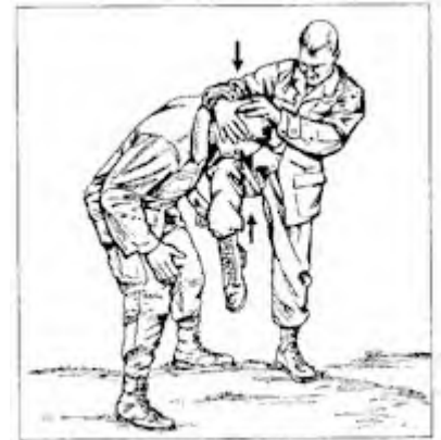
Figure 4-27. Knee strike to face.

Striking techniques include basic punch/kick techniques, as in sport martial arts like karate or tae kwon do , but emphasize combat-oriented striking like knee and elbow strikes.