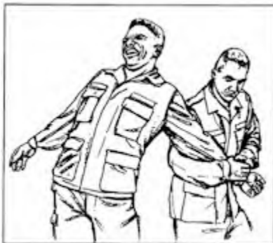
Figure 3-18. Elbow lock against the body.

Many grappling techniques are familiar to sport grapplers, such as this simple standing armbar.