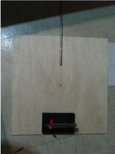
Orientation from above is shown:

Once the balance is achieved then rotate the bar magnet to be parallel to the axis of rotation to the dip needle.