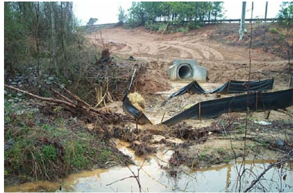
Fig. 1: Soil runoff near a fresh clearcut (Pratte)

Given this important role, it is amazing that we often treat soil like dirt. We strip away the overlying vegetation to plant crops or build houses, exposing it to erosional forces that wash and blow it away. We pour toxic herbicides and insecticides on it, removing or changing the important organisms that make the soil what it is. We irrigate it with water bearing minute traces of salt, slowly killing the soil as the salt concentrations build up to lethal quantities.