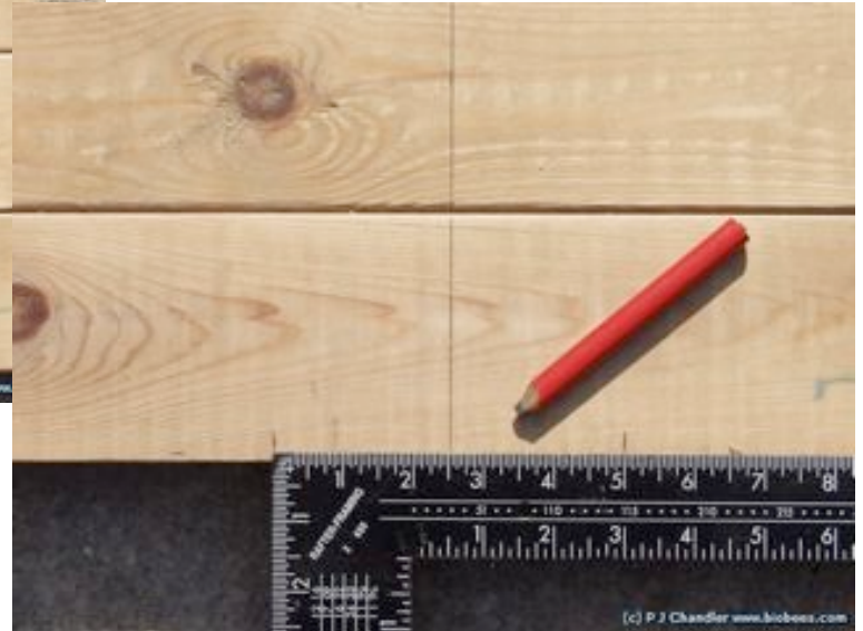
Mark 2.5 inches either side of centre on the bottom edge