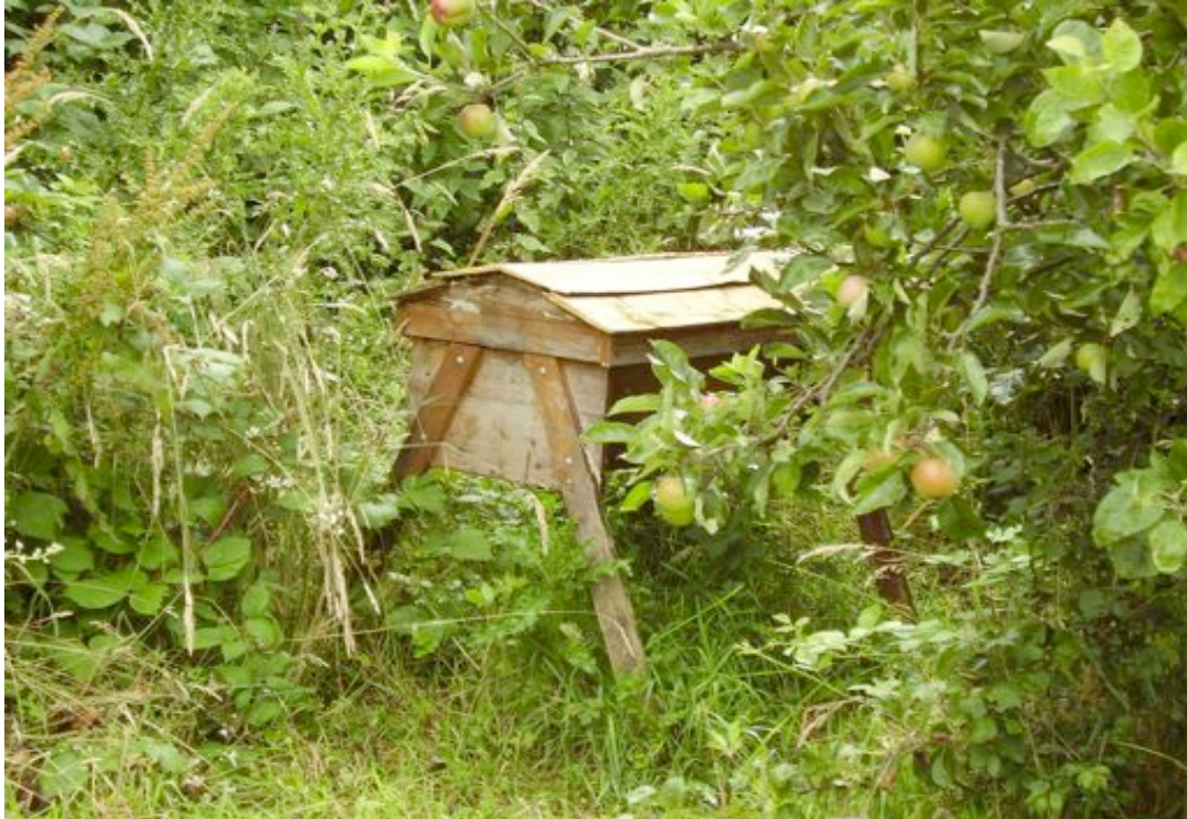
A lapped cedar roof has a rustic appeal and is preferable to plastic.