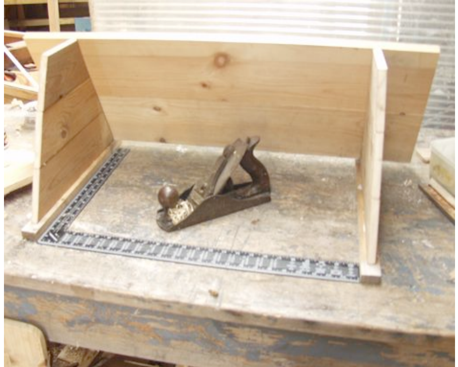
Position one of the side panels against the follower boards, resting on the top bars.