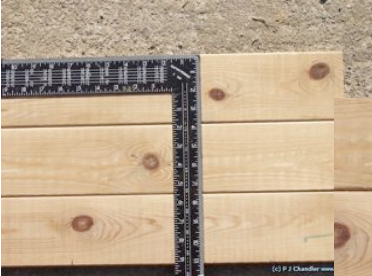
Draw a centre line to the bottom edge