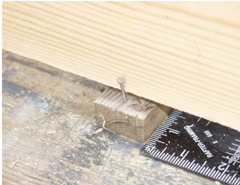
A small nail tapped into the top bar prevents the side panel from slipping off.

The hive is built upside down and inside out. The follower boards represent the 'inside' and now you are about to add the outer skin.