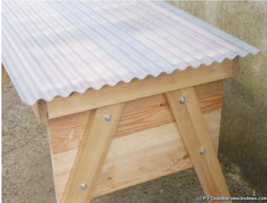
A simple roof using corrugated plastic, available from DIY stores.