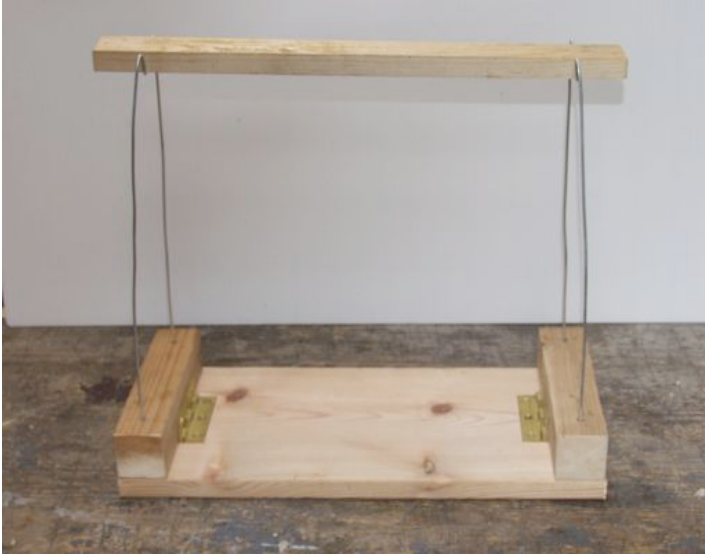
Here is the top bar stand on the bench...