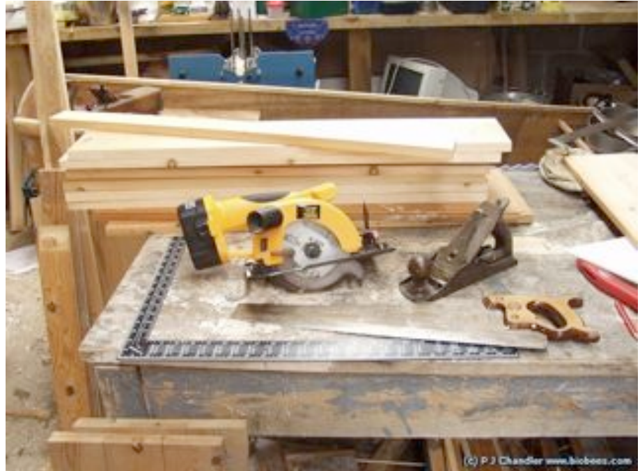
You don't need a fully-equipped workshop: a flat surface and basic tools are the essentials. You can build the hive using only hand tools – and a circular saw is a bonus, whether hand-held or table mounted.

Both long and short hives are built in exactly the same way - inside out and upside down - starting with the follower boards.