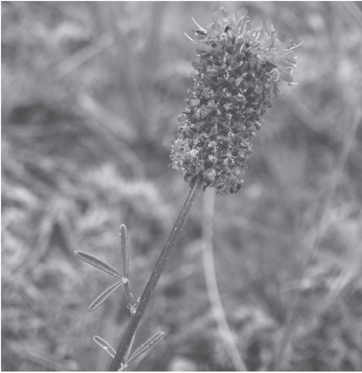
Purple prairie clover

but I wasn't going to let her catch me. I had almost gotten away, but just as I was reaching for the doorknob, she caught me from behind. I fell, smacking my nose hard against the doorknob.