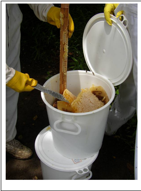
Picture 5 Harvesting honeycombs from top-bar hives

Harvesting honey from top-bar hives is quite simple and can be achieved without damage to the colony. The beekeeper selects combs containing honey but no brood: these will usually be the combs furthest way from the entrance.