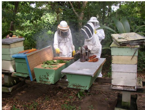
Picture 1 An apiary in Tobago with top-bar hives and frame hives

Between 2002 and 2004, beekeepers in Tobago, in cooperation with Bees for Development, experimented with the use of top-bar hives. The information and pictures shown here are from the research conducted within the Project 3 .