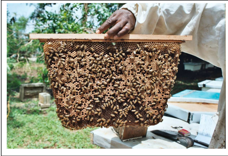
Picture 2 A comb with bees from a top-bar hive

needs access to supplies of foundation and other inputs, and an extractor for spinning honey out of the frames. These requirements make frame hive beekeeping inappropriate in areas of the world where such resources are not available, or are prohibitively expensive. The top-bar hive is an endeavour to bridge the gap between the most basic receptacle-type hives (for example, the skep), and more expensive frame hives. These aim to combine the low-cost benefits of local-style hives with some of the advantages of frame hive beekeeping. The only critical measurement in (these) low-technology, top-bar hives is the width of the top bars, which must provide the correct space for bees to build their comb and maintain a constant temperature.