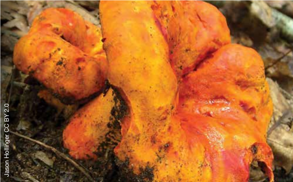
Jason Hollinger CC BY 2.0