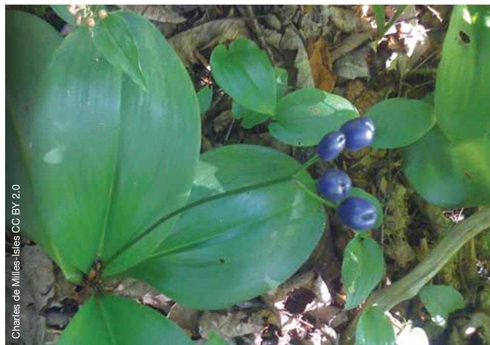
Charles de Millies-Isles CC BY 2.0