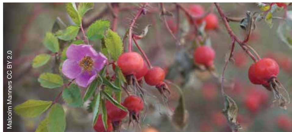
Malcolm Manners CC BY 2.0