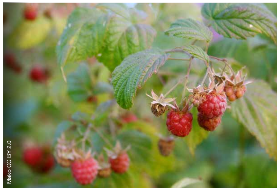
Mako CC BY 2.0