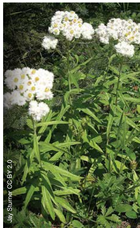
Jay Sturmer CC BY 2.0