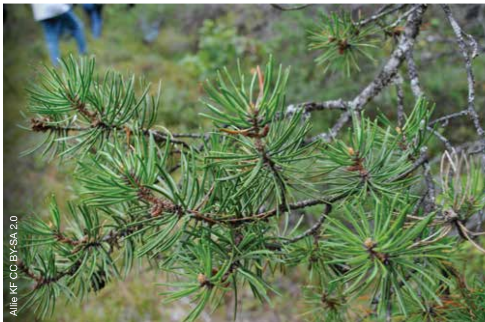
Allie KF CC BY-SA 2.0